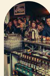
Bars for great After Work