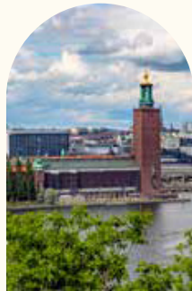
Stockholm's best viewpoint: Skinnarviksberget