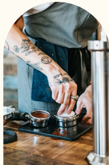
Best coffee in town