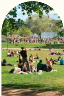
Parks and waterfronts

Nestled in the greenery of Tantolunden, this area offers refreshing lunchtime walks and jogging routes by the water. Here, you'll also find a beach, food trucks, boules and mini-golf. Tantolunden is one of the largest green spaces in the city center and is a true gem all year round.